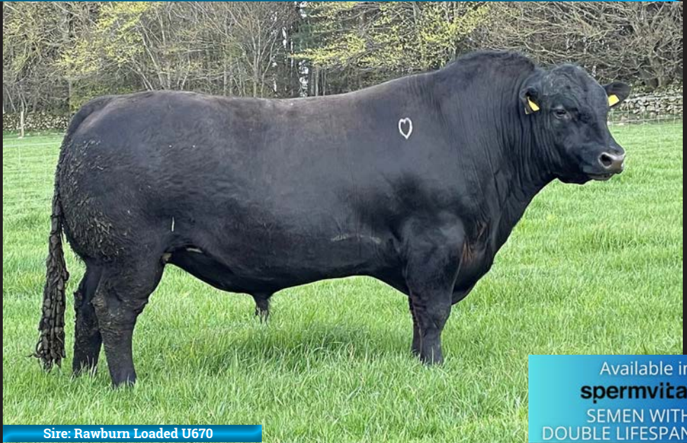
Sire: Rawburn Loaded U670

Available in spermital SEMEN WITH DOUBLE LIFESPAN